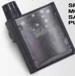
SP6 MOTORIZED SAMPLING PUMP