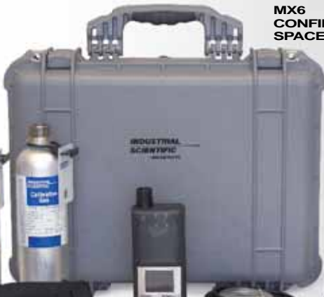
MX6 CONFINED SPACE KIT